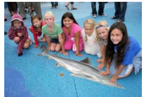
School children on opening day with the life sized bronze of a soupfin shark at The Map