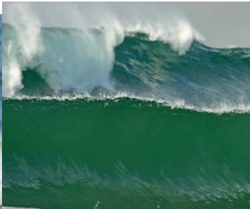
Above: unridden wave during December swell.