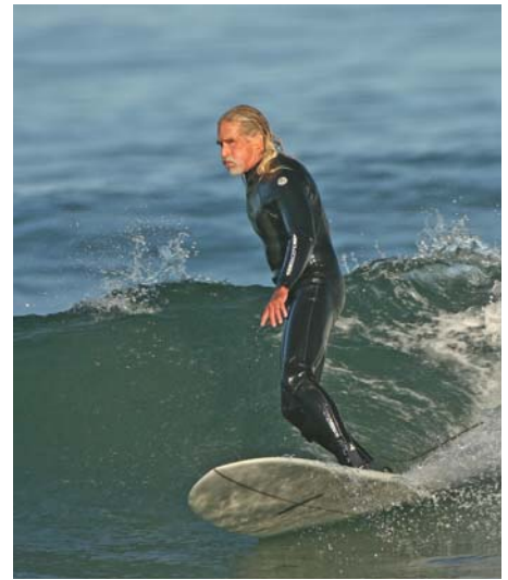
Above: Inside Wave Dave