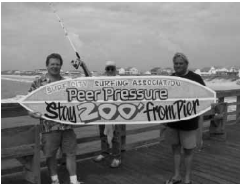
Surf City members sport new surf sign