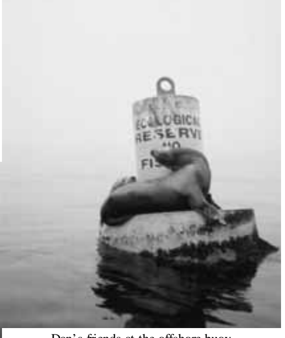
Dan's friends at the offshore buoy