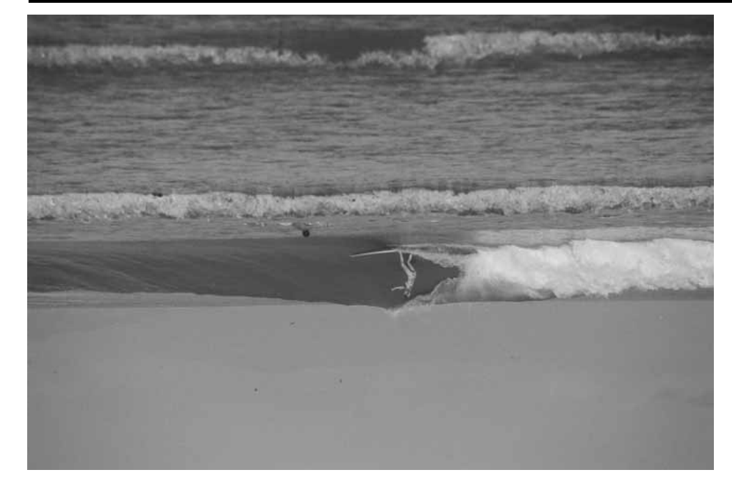
La Jolla Shores Surfing Association 8070 La Jolla Shores Dr. PMB # 446

It's DUES paying time! Dues notices have been mailed and many of you have already paid — thank you! The annual dues help support the club and it's monthly operating expenses such as keeping all members informed though our newsletter. Please send in your dues as soon as possible and thanks again to all of you who have renewed your memberships and for your continuing support. If you'd like to become a member please contact us at mail@ljsla.org