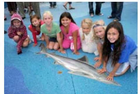
School children on opening day with the life sized bronze of a soupfin shark at The Map