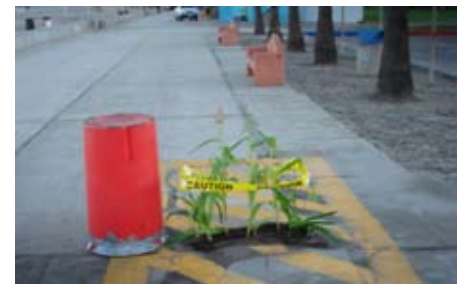
surfers at the Shores do their own boardwalk beautification with some creative gardening!

LJSSA has set aside $4,000 in restricted funds to be used on future improvements. We expect to be involved with any community plans moving forward and will look forward to all your input. We've discussed trying to erect a surfing "sign" at the beach entrance that would educate surfers about our break and serve notice that we care. Any or all of the above projects will take more than $4,000, but LJSSA expects to contribute to and support projects that will enhance and beautify our beach and boardwalk to make them cleaner, safer, and better!