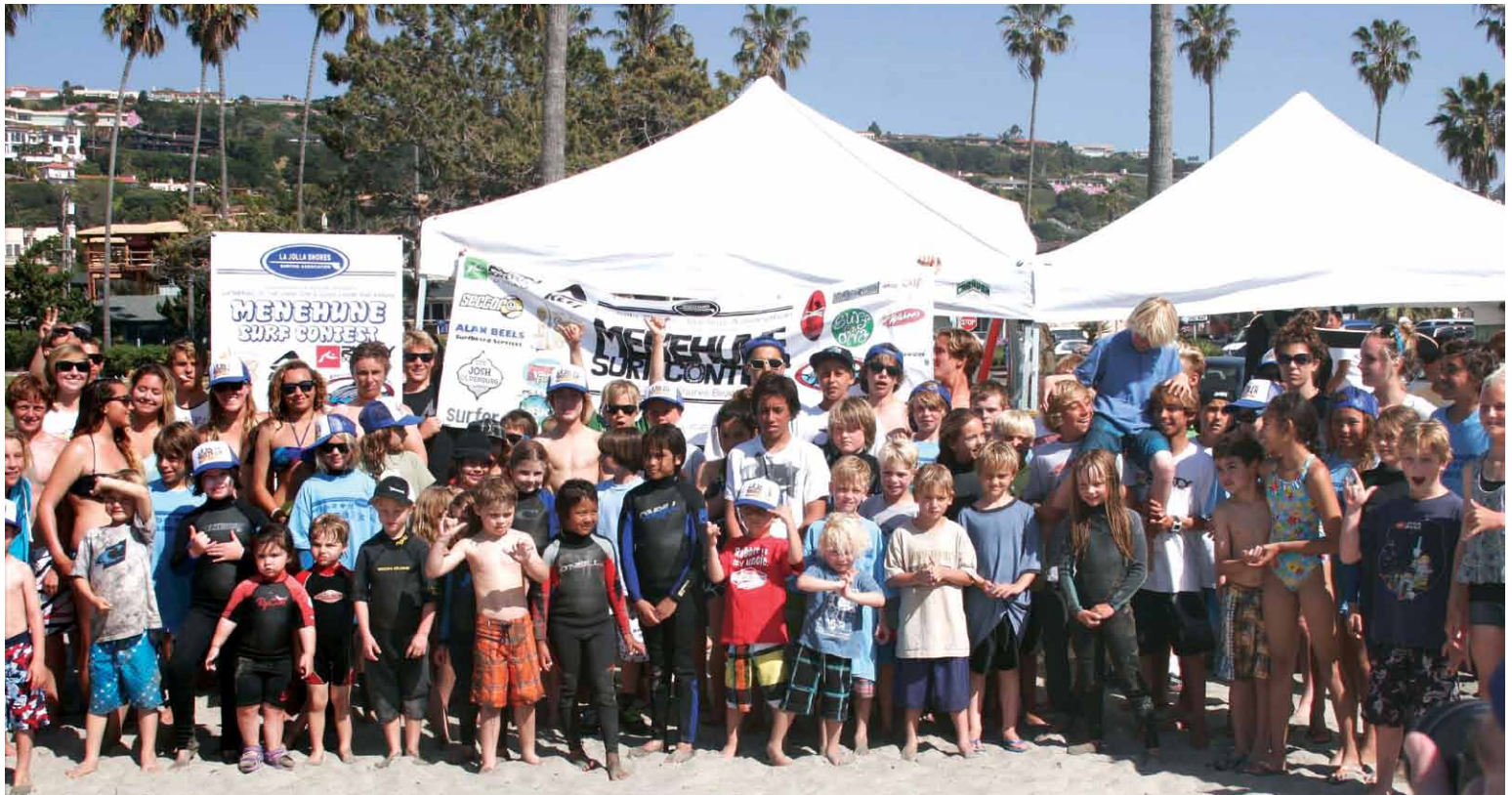
Contestants from the 11th Annual Menehune Surf Contest at La Jolla Shores, 2011