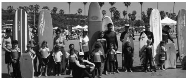
Right

We extend our congratulations to all our division winners and we thank everyone for their good sportsmanship!