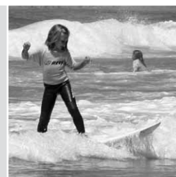
Left and below